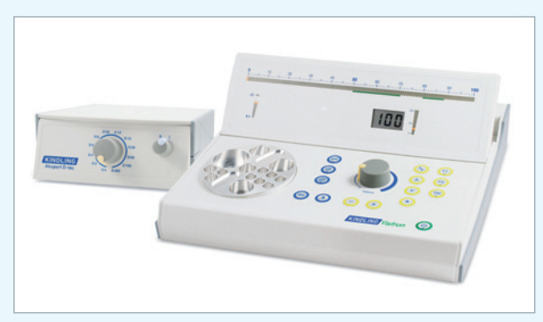
Akuport D-tec + Vistron