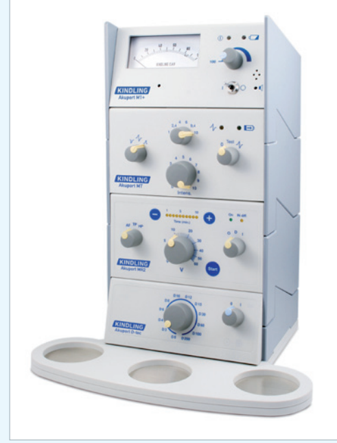
Akuport-Tower complemented with Akuport D-tec