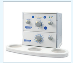
Akuport D-tec + Akuport MR2